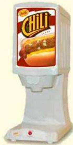
Model HT2-03 APS