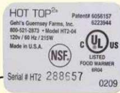
Location of Serial Number on back of dispenser

CPSC is still interested in receiving incident or injury reports that are either directly related to this product recall or involve a different hazard with the same product. Please tell us about it by visiting https://www.cpsc.gov/cgibin/incident.aspx .