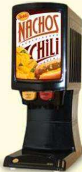
Model HT2-04 Dual