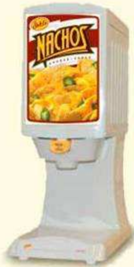
Model HT2-04 Single